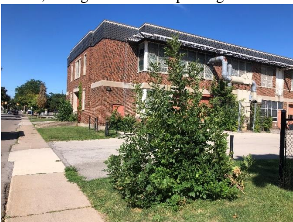
Image 5: Subject property from southwest corner, facing northeast.