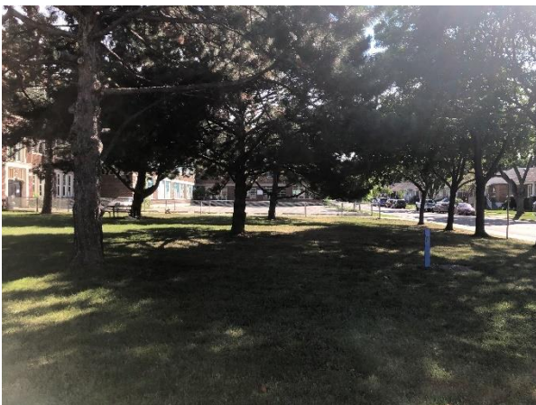
Image 1: Subject property from northwest corner, facing southwest to parking lot.