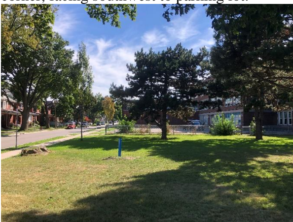
Image 3: Subject property from northeast corner, facing southwest to parking lot.