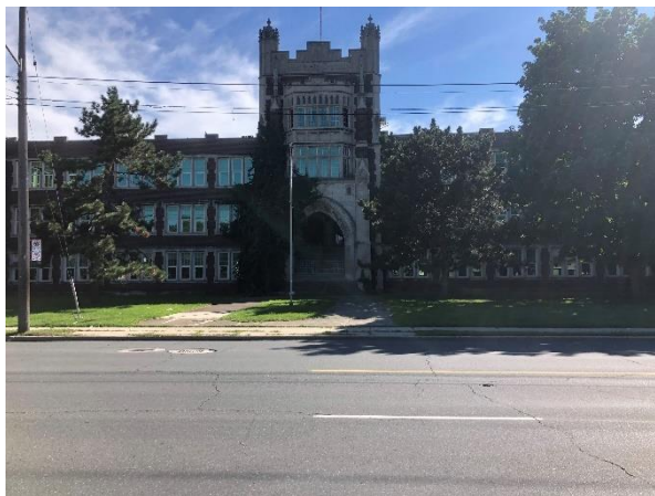
Image 2: Subject property from north of Main Street showing building, facing southwest.